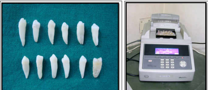
[Table/Fig-4]: Selection of samples [Table/Fig-5]: Equipments used in the study Thermocycling machine

Division and restoration of samples [Table/Fig-4]. Collected teeth were divided into 9 groups with 6 teeth in each group. These samples were stored in distilled water for further use.