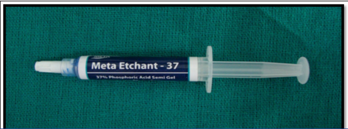
[Table/Fig-1]: Materials used in the study Etchant, 37 % Phosphoric acid, Meta Etchant – 37