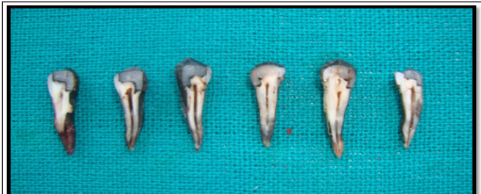
[Table/Fig-7]: Some of the sectioned samples