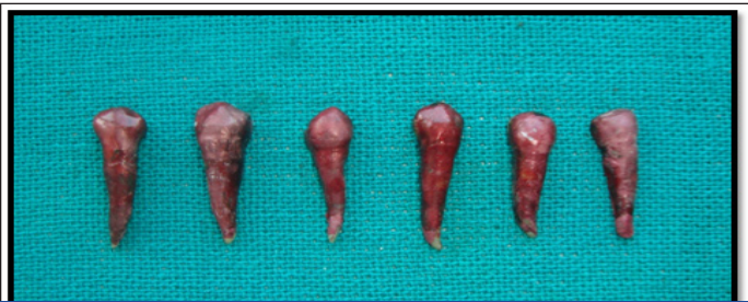
[Table/Fig-6]: Samples after application of nail varnish

All the specimens were subjected to thermal cycling at 6°C, 37°C,