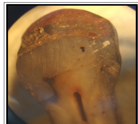
[Table/Fig-11]: Equipments used in the study Stereomicroscope (Magnus) [Table/Fig-12]: Sample showing microleakage score 0 [Table/Fig-13]: Sample showing microleakage score 4