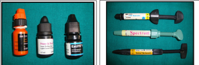
[Table/Fig-2]: Bonding agents used in the study 1. Single bond (3M, ESPE) 2. Prime and bond NT (Dentsply) 3. Excite (Ivoclar Vivadent) [Table/Fig-3]: Composite Materials used in the study 1. Z 100 (3 M, ESPE) 2. Spectrum TPH (Dentsply) 3. Tetric (Ivoclar Vivadent)